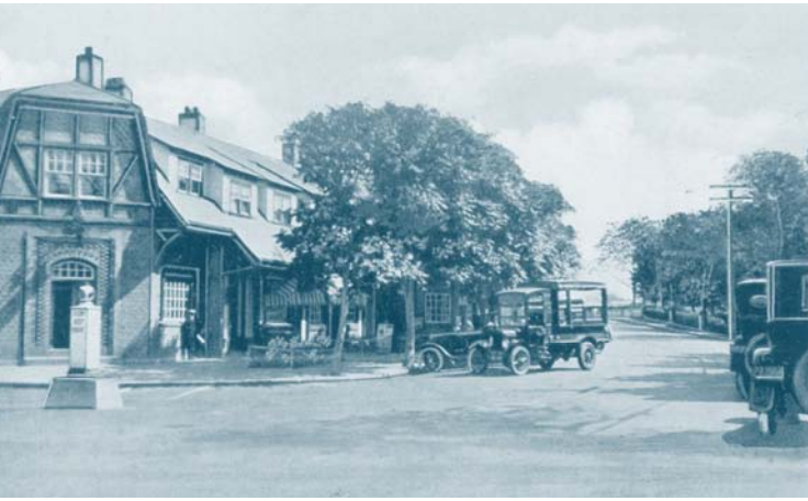
Images of Harwich Exchange Building, Chatham Main Street and Brewster's Crosby Mansion